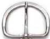
Flat Stainless D