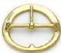
#3 Solid Brass Polished

Cinch Buckles - 3 inch diameter/width unless otherwise noted