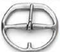
#9 Flat Stainless