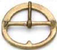
BORK™ #302 Tumbled Bronze