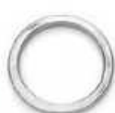
2 1/2" Stainless Flat O-ring